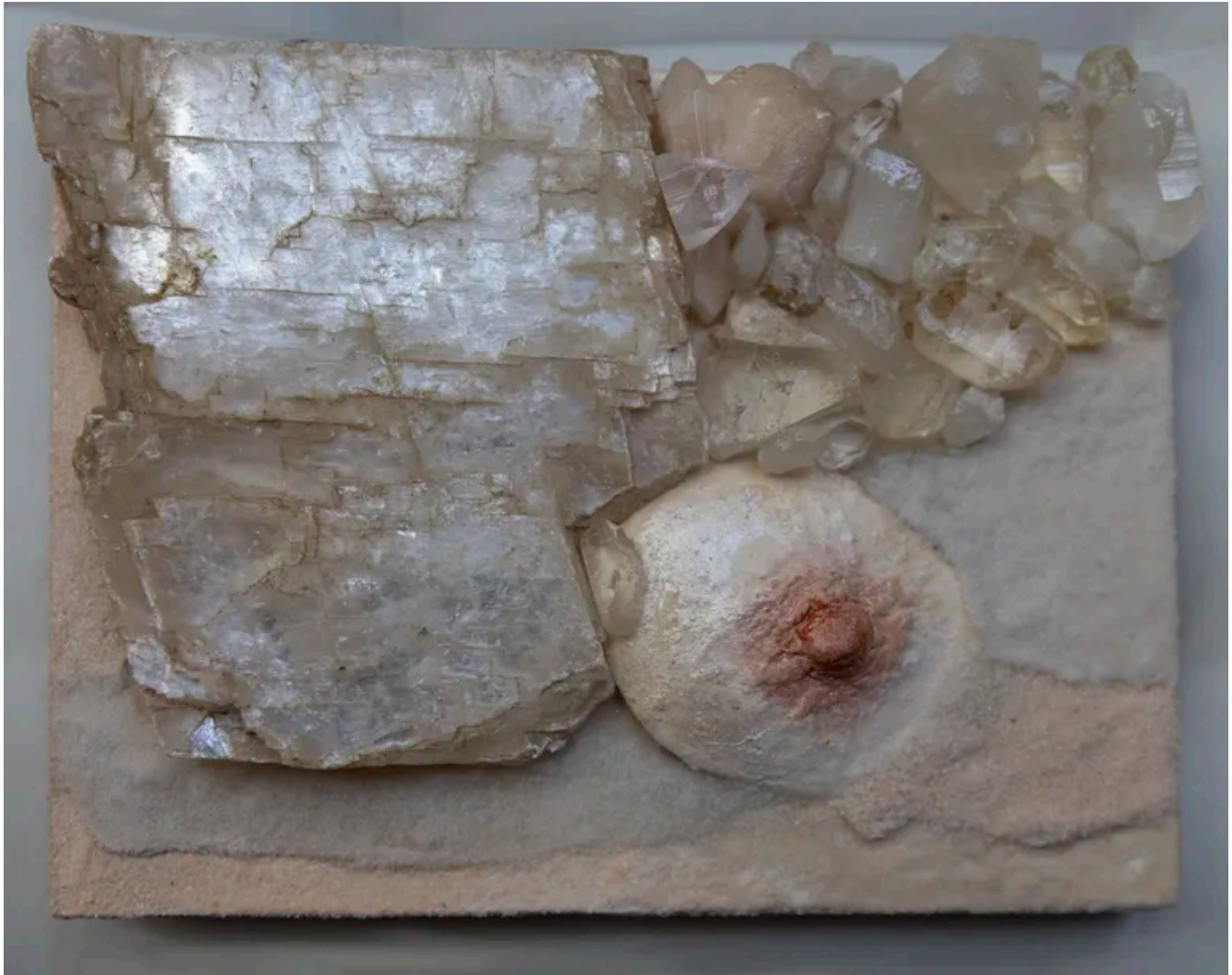
Penny Slinger, Iridescence of Being, Mother's Milk

that this simple elegance managed to capture and illustrate the deeply rooted relationship between nature and the feminine. In our modern world, we have lost touch with that deeply embedded bond, and I wanted to resurrect it, bring it back to life, with all its nuance and emotive power of resonance.'