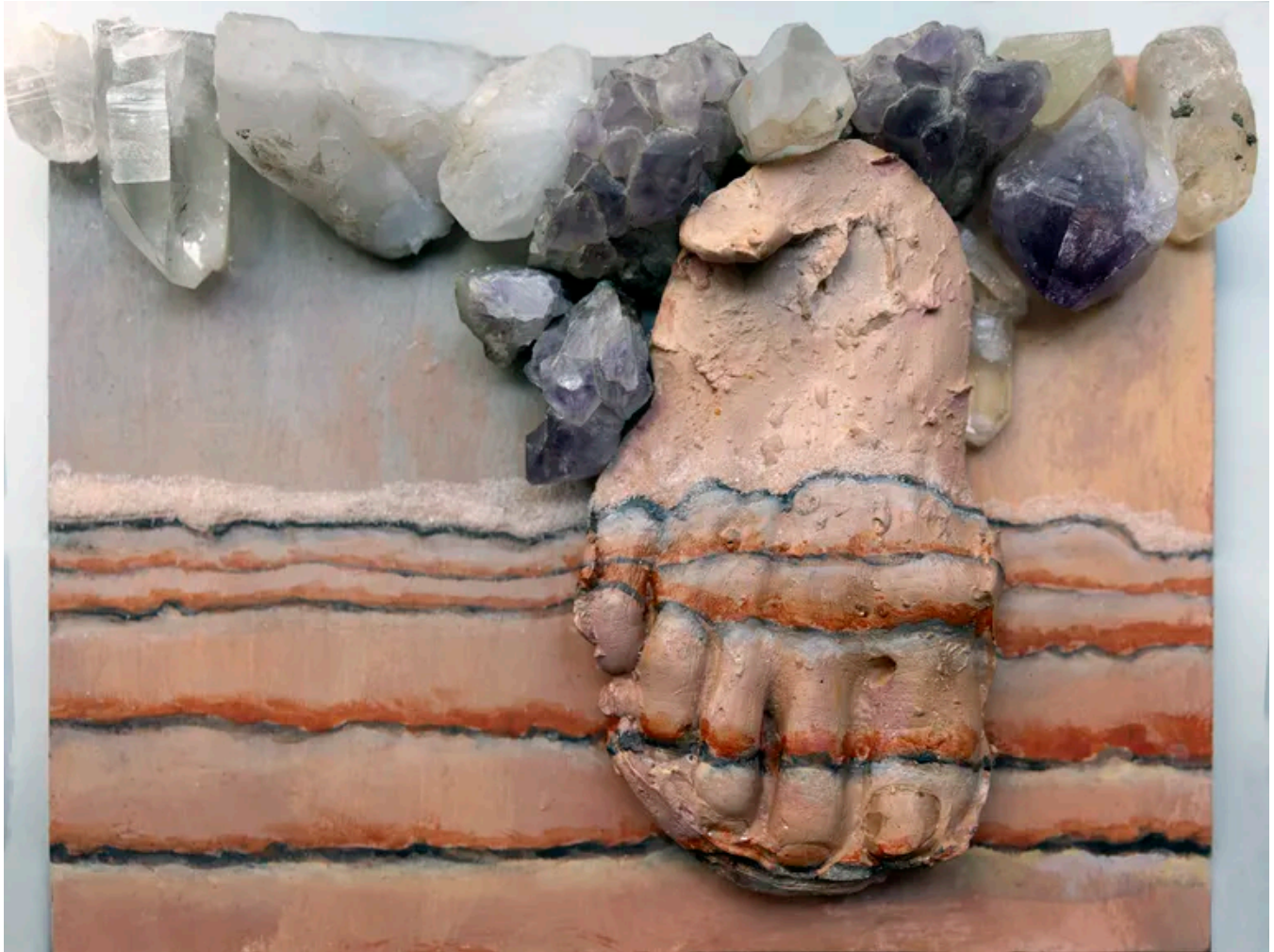
Penny Slinger, Footprint in the Rocks, Lasting Impression

photographed several of my model friends and, making collages of these photos combined with the mountainscapes, created the series Women of the Rocks .'