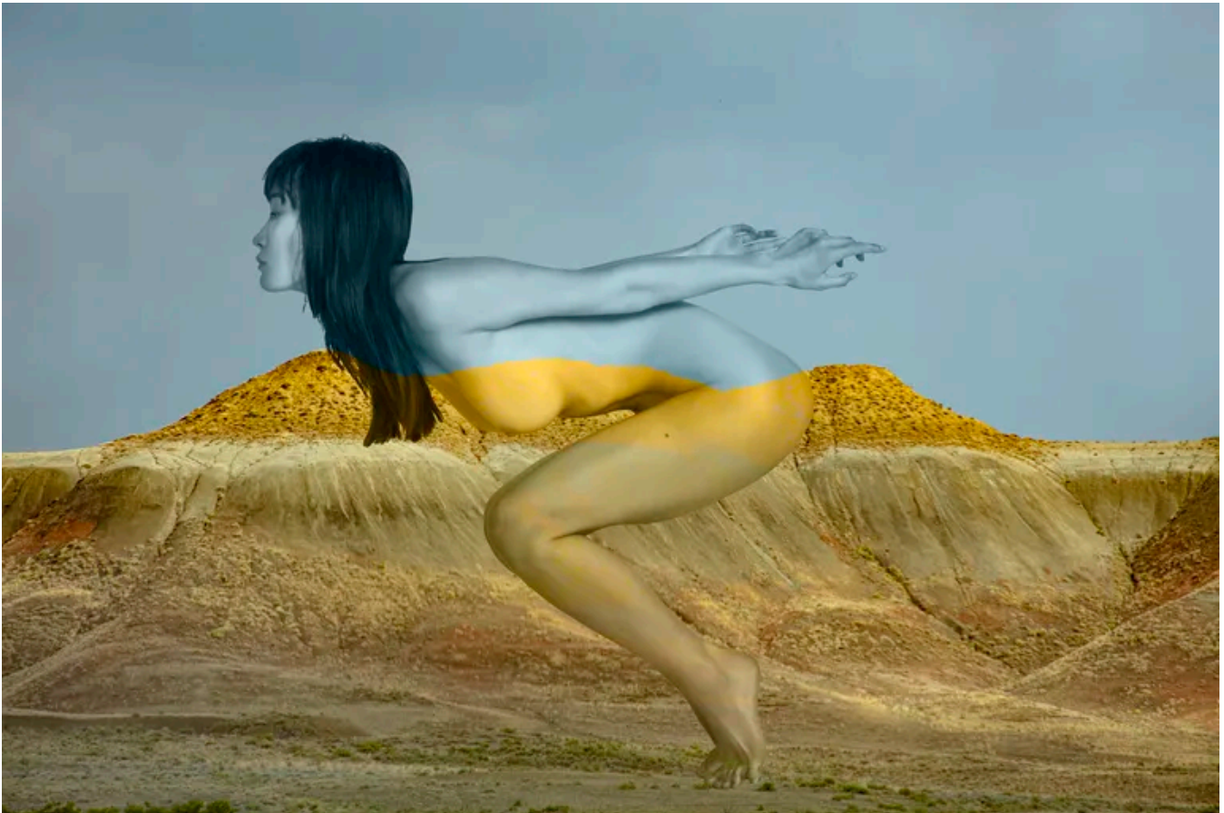
Penny Slinger, On Point (Image credit: Penny Slinger)