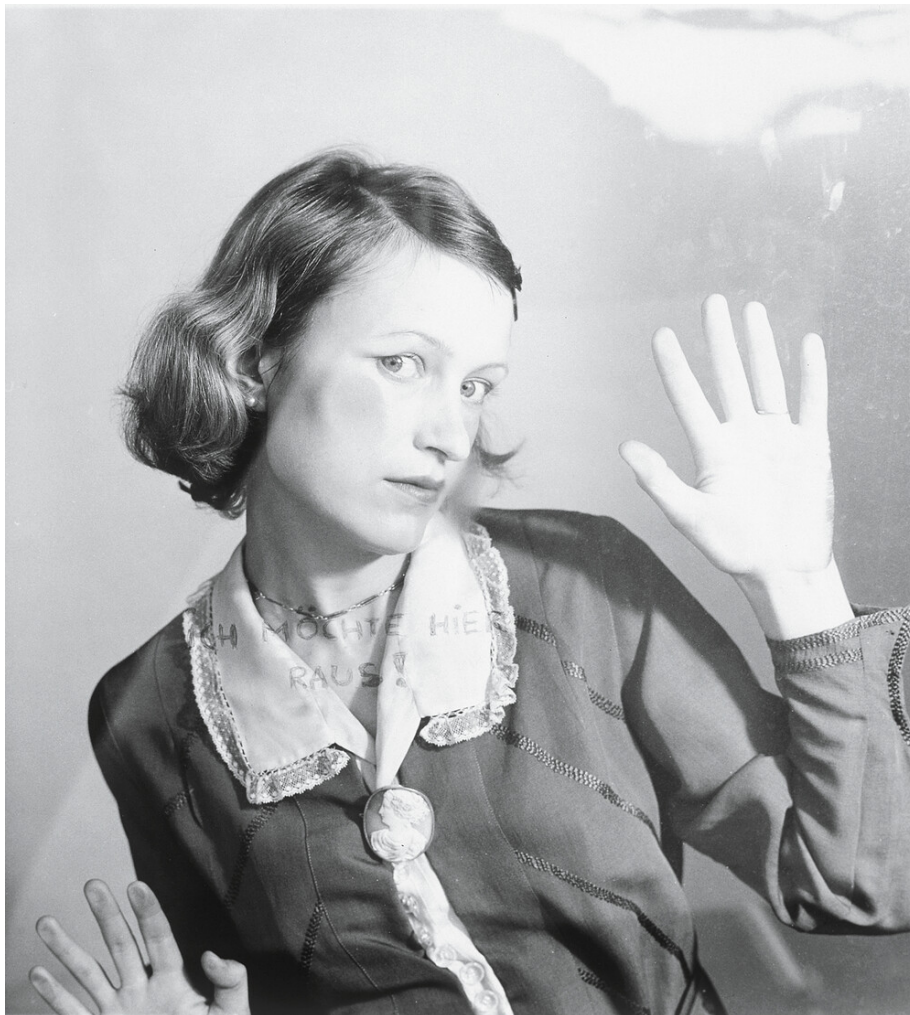
Fig. 1 Ich möchte hier raus!(I Want Out of Here!) , by Birgit Jürgenssen. 1976. Black-and-white photograph, 40 by 30 cm. (© Estate Birgit Jürgenssen; VERBUND COLLECTION, Vienna; courtesy Galerie Hubert Winter, Vienna; Bildrecht, Vienna; exh. Parc des Ateliers, Arles).

Beauty / Female Body'; 'Female Sexuality'; and 'Identity / Role-Play'. The first of these sections opens the exhibition with I Want Out of Here! FIG.1 by Birgit Jürgenssen (1949–2003), a photographic self-portrait of the artist pressing her face and hands against a pane of glass, across which the titular words are written in German. A similar manifestation of confinement and escape appears in other works, such as a photograph from the series Untitled (Glass on Body Imprints) (1972/1997/2009) by Ana Mendieta (1948–85), Against the Glass (1982/2019) by Gabriele Stötzer (b.1953) and Poemim (Series A) (1978) by Katalin Ladik (b.1942). These images of pressed female skin reference invisible constraints, evoking the 'glass ceiling' often encountered by women. This challenging of the prison-house of patriarchy threads throughout the exhibition, returning in many works that utilise methods of confinement and restraint, for example, four works from the nets series (1980) by Anneke Barger (b.1939) and all eight of the Isolamento sequence FIG.2 by Renate Eisenegger (b.1949).