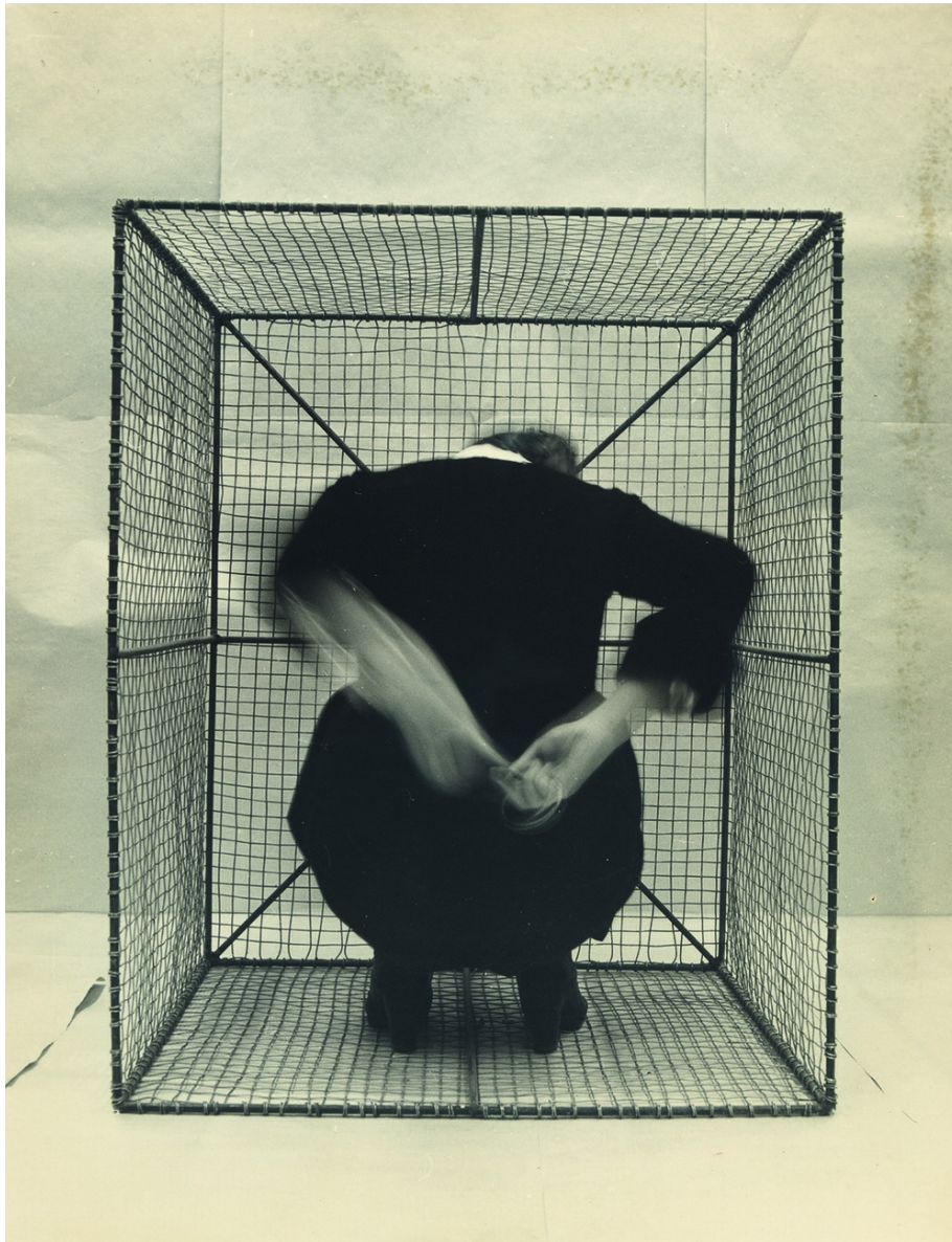
Fig. 3 Individual Mythology. Cage , by Orshi Drozdik. 1976. Gelatin silver print, 27.4 by 21.4 cm. (© the artist; VERBUND COLLECTION, Vienna; courtesy Knoll Galerie, Vienna; exh. Parc des Ateliers, Arles).

subversive to the performative-offensive'. 3 This violence is often explored through repetition or seriality, for example the insistent chanting of '¡Negra! ¡Negra! ¡Negra! ¡Negra!' by Victoria Santa Cruz (1922–2014) in the 1978 recording of her poem Me Gritaron Negra ( They Called Me Black ), which counters the relentless repetition of racist and patriarchal violence. Similar references are also clearly laid out in the film and protest text In Mourning and in Rage (1977) by Suzanne Lacy (b.1945), which states: 'I am here for the half a million women who are being beaten right now in their homes. I am here for the thousands of women who are raped and beaten and have not yet found their voices'.