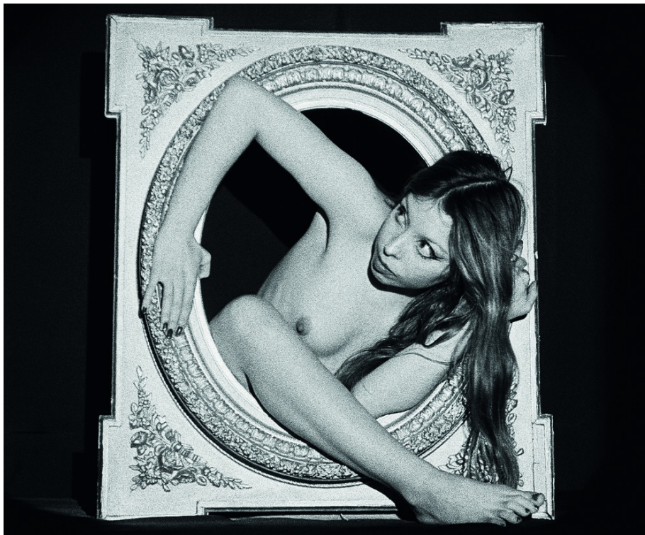
Fig. 4 Tentative pour sortir du cadre à visage découvert (Attempting to Escape the Frame) , by ORLAN. 1966. Black-and-white photograph, 133.5 by 120 cm. (© the artist; VERBUND COLLECTION, Vienna; courtesy Gallery Ceysson & Bénétière, Paris; Bildrecht, Vienna; exh. Parc des Ateliers, Arles).

the objectification of women in commercial cinema, through the male gaze. It is shown alongside a selection from the Bride's Cake Series (1973) by Penny Slinger (b.1947), in which the artist photographs herself as a parodic-erotic wedding cake. In ICU, Eye Sea You, I See You FIG.5, Slinger's legs are splayed, her crotch collaged over with an image of a rolling wave covered by an eye. This is followed by Annegret Soltau's (b.1946) (purposefully mistitled) stitched photograph Vagina I (1978) FIG.6, in which an eye is sutured into a vulva, evoking the wounds encountered in the process of childbirth. These works are juxtaposed with a range of films, including Consumer Art (1972–75) by Natalia LL (1937–2022), in which acts of consumption are insistently eroticised, forming complex dialogues and interconnections, revealing the significance of touch and corporeality and showing the ways in which humour, irony and wit are significant tools of these artists' critiques.