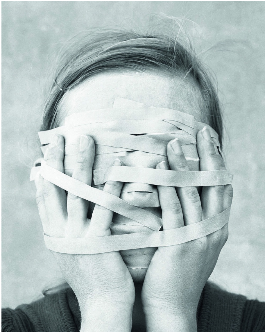
Fig. 2 From the series Isolamento , by Renate Eisenegger. 1972. Black-and-white photograph, 40 by 29.5 cm. (© the artist; VERBUND COLLECTION, Vienna; exh. Parc des Ateliers, Arles).

analysed in the video work Einwicklung mit Julia ( Wrapping with Julia ) (1972), in which the artist Ulrike Rosenbach (b.1943) binds herself to her young daughter with bandages, an image that plays on bonds, bondage and the labour of motherhood; the German word wickeln refers to changing a child's nappy. Elsewhere, artists frequently represent themselves entrapped, for example, in Orshi Drozdik's (b. 1946) photographic documentation of her actionist performance in which she crawls out of a cage, Individual Mythology. Cage FIG.3, and Sculpture #2 (1968) by Kirsten Justesen (b.1943), an (open) cardboard box with a photograph of the artist curled into a ball, whereas a nineteen-year-old ORLAN metaphorically breaks from the frames of art history in Attempting to Escape the Frame FIG.4.