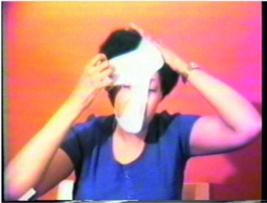
Fig. 7 Still from Free, White and 21 , by Howardena Pindell. 1980. Video, duration 12 minutes and 15 seconds. (© the artist; VERBUND COLLECTION, Vienna; courtesy Garth Greenan Gallery, New York; exh. Parc des Ateliers, Arles).