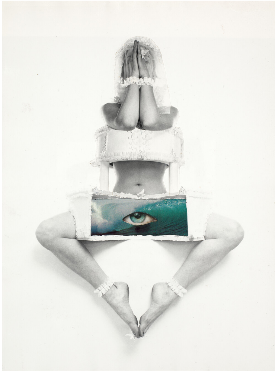
Fig. 5 ICU, Eye Sea You, I See You from the series Bride's Cake Series , by Penny Slinger. 1973. Photocollage, 40.6 by 30.5 cm. (© the artist; VERBUND COLLECTION, Vienna; courtesy Blum & Poe, Los Angeles; Artists Rights Society, New York; exh. Parc des Ateliers, Arles).

individual artists. For example, Free, White and 21 Fig.7 by Howardena Pindell (b.1943) is a narration of the artist's personal experiences of institutional, organisational and social discrimination, mapping the relentlessness of the oppression that Black women are exposed to but which, as Pindell's film illustrates, are often explained away as unreal and 'paranoid' – another version of the invisible boundaries that surround women.