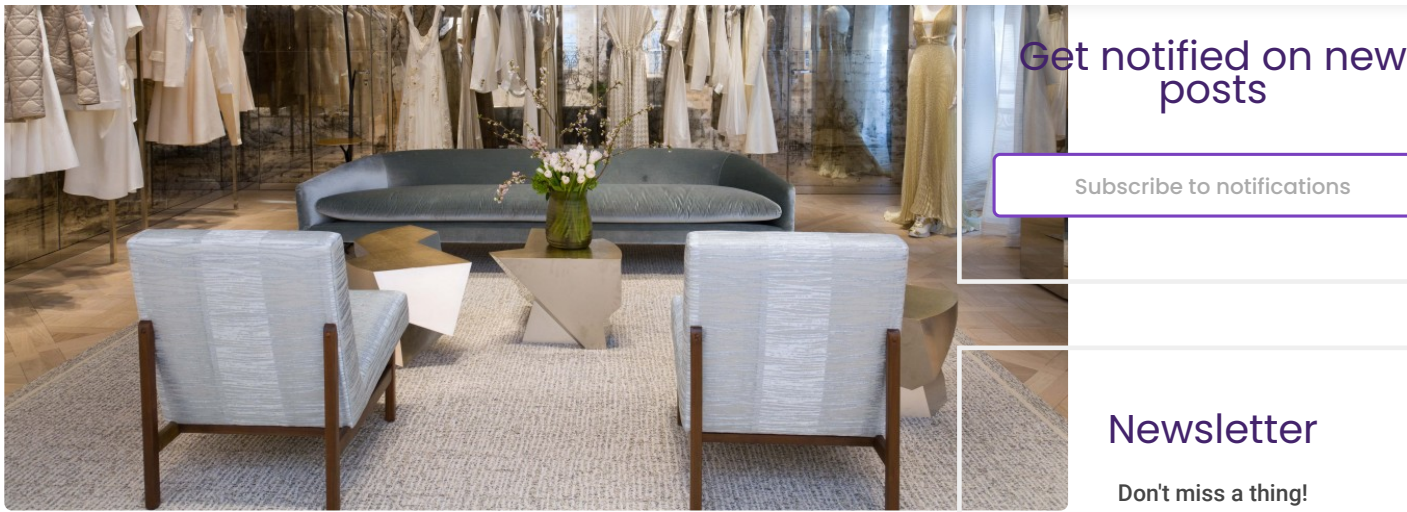
DIOR Paris, Avenue Montaigne - newly renovated