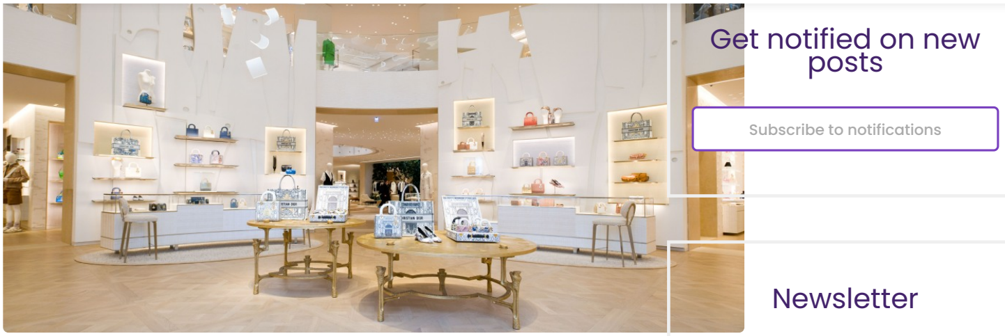
DIOR Paris, Avenue Montaigne - newly renovated

Don't miss a thing! Sign up to receive daily news