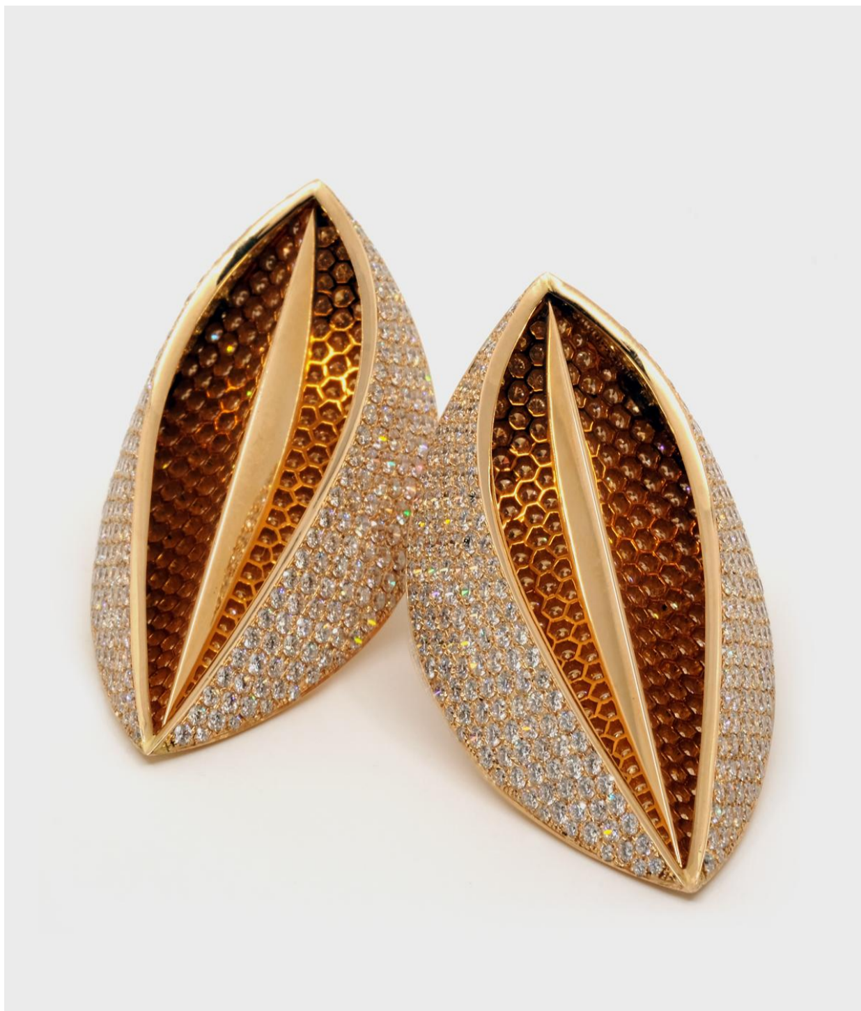
Studio Renn, 'Seed-Leaf'

Jewellery is also included, with Indian brand Studio Renn presenting six pieces from the 'Seed-Leaf' collection, which will debut at the exhibition, representing the cyclical nature of fertility and abundance in gold and precious stones.