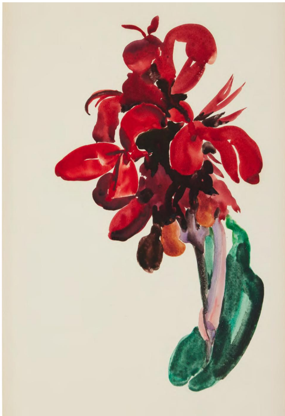
Georgia O'Keefe, Canna Series . Watercolor on paper, executed in 1918/20. Provenance: Acquired by bequest to the present owner in 2019