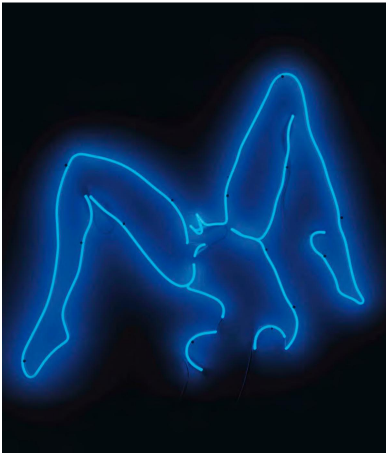
Tracey Emin, Blinding , clear blue neon. Executed in 2008, this work is number 8 from an edition of 10, plus 2 artist's proofs. Provenance: the artist

Pieces consider both classical motifs and cheeky double entendres, from Reka Nyari's Pussy print, which intertwines the linguistic and the sexual, to Penny Slinger's rethinking of everyday motifs. With a slight shift in perspective, domestic objects – long symbols of women's repression – become markers for female pleasure.