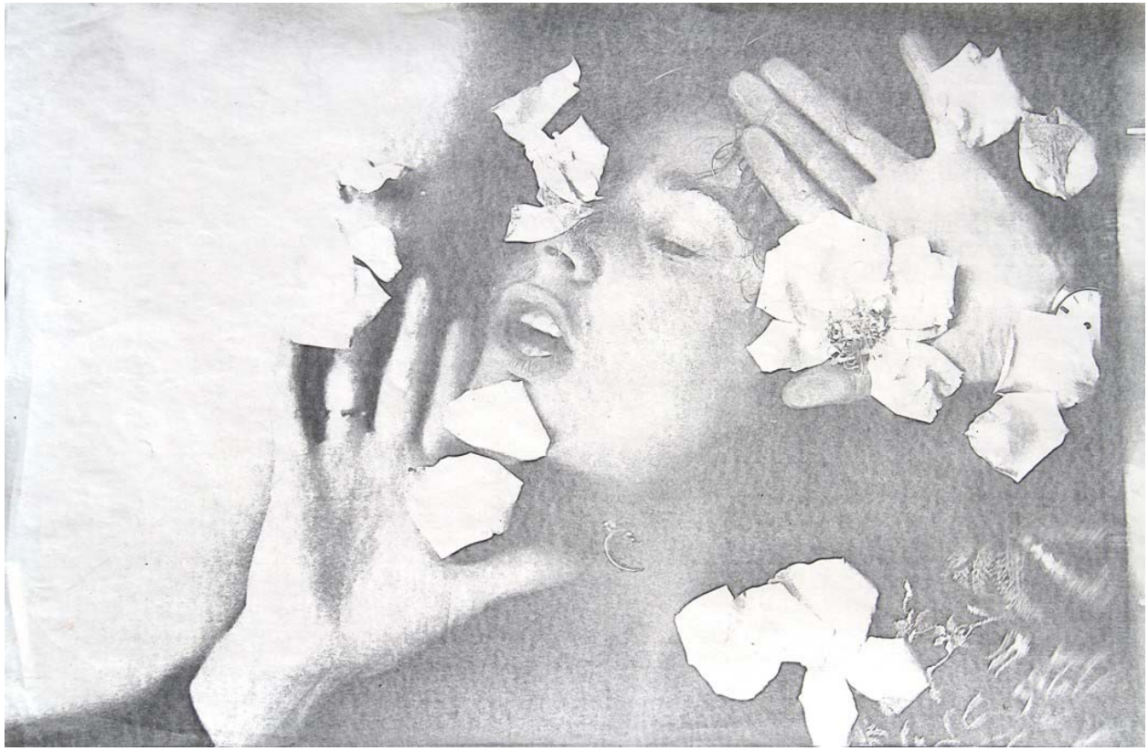
"Coming Up Roses/Petals Fall-2", 1974Xerox self mono print