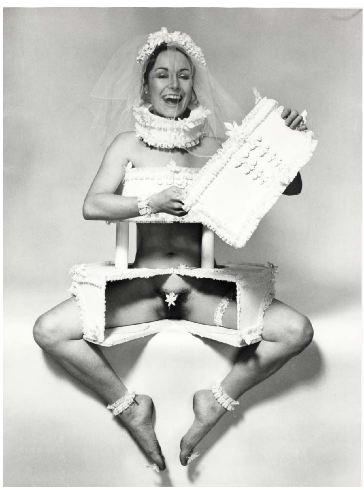
Penny Slinger, "Wedding Invitation –2 (Art is just a piece of Cake)" (1973),