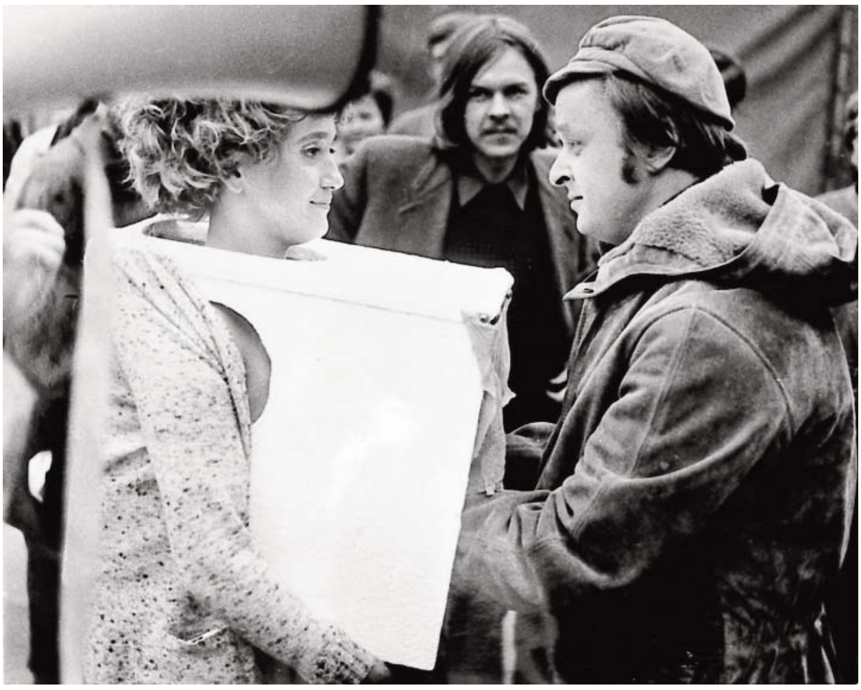
Valie Export, "Tap and Touch Cinema" (1968), video, black and white,