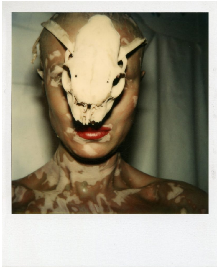
Birgit Jürgenssen's Ohne Titel (Selbst mit Schädel) / Untitled (Self with Skull) (1979).

Algus, who was an early champion of many of the artists in the Frieze presentation, says Tompkins's and Bernstein's material was a tough sell 15 years ago. Fellow artists, including William Copley and Paul McCarthy, were early collectors and supporters of Bernstein, but it took the seal of approval from larger galleries to convince a broader base of collectors to buy in.