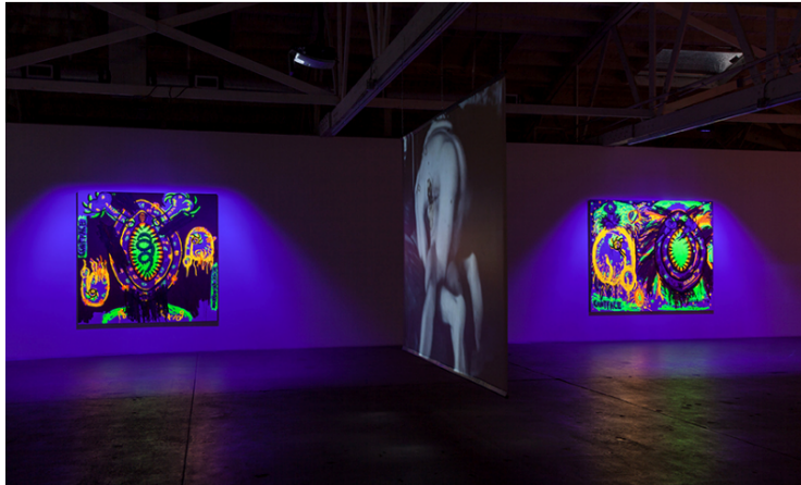
Installation view of “CUNT” at Venus Over Los Angeles.

“Unless you are an institution that has a feminist focus, how do you get your trustees on board?” she says. “Vaginal imagery has been part of mainstream art history since the beginning, but as soon as you start making work that has a phallus, it’s a different story.”