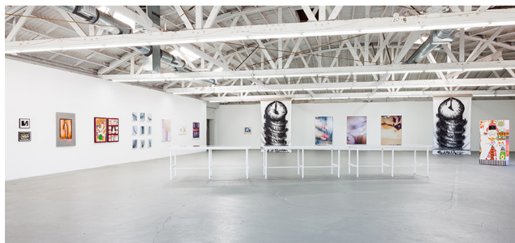
Installation view of "CUNT" at Venus Over Los Angeles.

During the first half of these artists' careers, however, mainstream institutions weren't showing any work by women—let alone sexually explicit work. As a result, they established their own spaces to show. The Polish artist Natalia LL, whose pornographic material was confiscated during a police raid on her apartment in the early 1980s, opened her own gallery in Wrocław at the height of Communist rule.