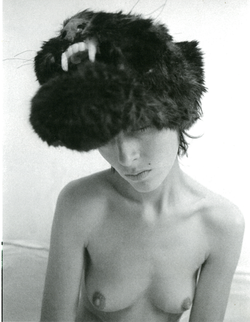
Penny in Bear Mask, 1971 Papier mâché on armature with fur & mixed media, © Penny Slinger, courtesy of the artist.