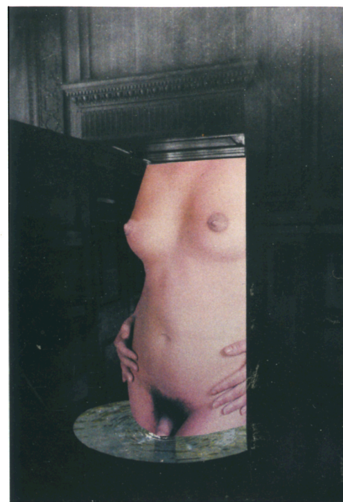
The Hermaphrodite, 1970-1977 Photo collage Exorcism series.

One effective way...you know I had sixty-four forms! There's so many different ways, but the main thing I would say is to find a way to still your own mental prattle. Get yourself out of the way and work on being open and available. There's a saying that the divine can't come unless they're called - and we forget that. It's setting that intention, setting that ground. It's just between you and the energy and finding ways where you can get your mind quiet enough and wide enough. And ask, and ask - I did this when I was recently in Hawaii. I went to Maui after leaving Boulder Creek and every night I'd go to bed and say, "Just help me empty my mind, so that I'm able to receive what the land and the spirits here want to give me." And I guess, after about a week of doing that, I got that. [laughs]