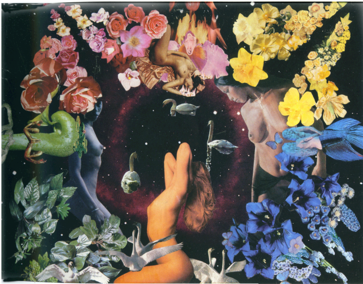
Swan Lake, 1976-1977 Collage on board 20 x 25 1/2 inches