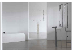
Gedi Sibony "The Terrace Theater"