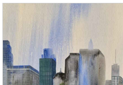
Libbet Loughnan "Six Feet Apart"