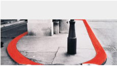
VALIE EXPORT's Transgressive Show for the 1980 Venice Biennale Reappears in London