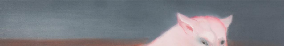
On Our Radar: The Best Exhibitions in Europe Right Now