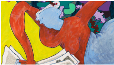
'The Older I Get, the Bigger I Want These Women to Be!'