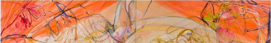
Jadé Fadojutimi Rejects Labels