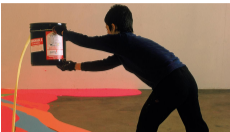
Lynda Benglis Pours One Out