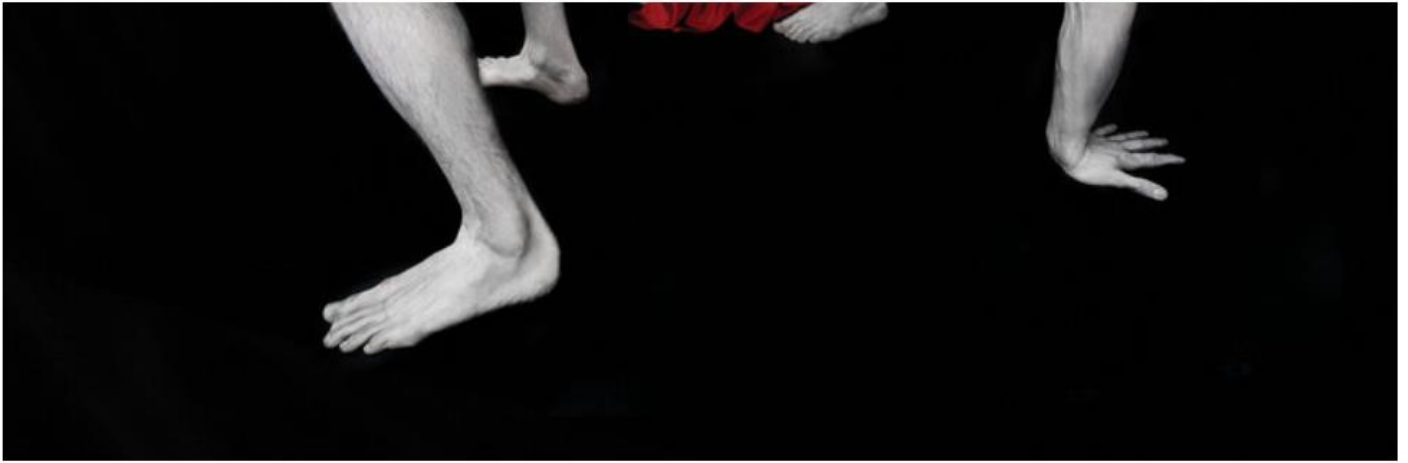
SILVIA TCHERASSI dress and BETONY VERNON necklace and bracelet.

The editorial images presented here in Flaunt were the first time you've officially turned your lens and aesthetic toward a fashion shoot, although you have been embraced by some of fashion's most notable names. What were some of the challenges in putting a purely art-aesthetic toward one that deals primarily with the buying and selling of clothes?