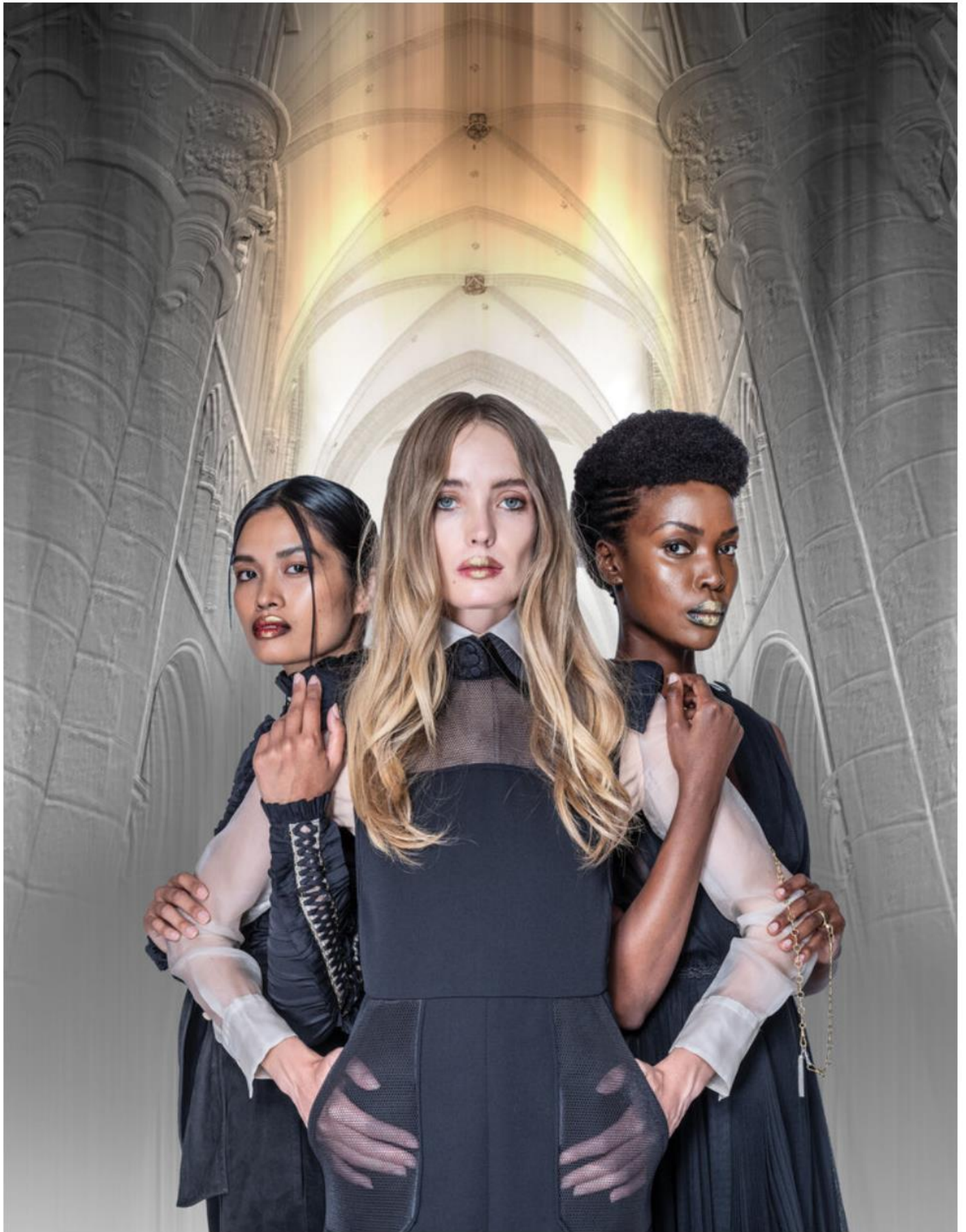
ZIMMERMANN top and pants. FENDI dress and shirt. ADEAM dress and BETONY VERNON choker.