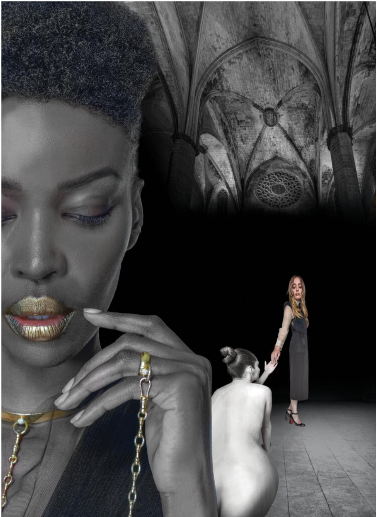
ADEAM dress and BETONY VERNON choker. FENDI dress and shirt.

Above all, Penny Slinger is an artist. With her recent 2017 documentary, Penny Slinger: Out of The Shadows , a collaboration with Dior, multiple gallery shows across Europe, New York and LA—Slinger's art world ascent is palpable, alive, and influential to scores of artists. After graduating from Chelsea College of the Arts in London, Slinger began working in the late '60s, connecting with influential artists like Max Ernst through her patron, Sir Roland Penrose, and publishing her first book, 50% The Visible Woman , with her penchant for collage on full display. By the late '70s, she had all but abandoned the art scene, viewed by many as a vanguard to feminist expression, and praised by critics like Laura Mulvey, famously remembered for coining the term, "male gaze." With her films live-scored by Kim Gordon and Lizzi Bougatsos, to a Haute Couture dress designed after her Doll Houses , we are excited to see the next phase of Slinger's ongoing visionary work.