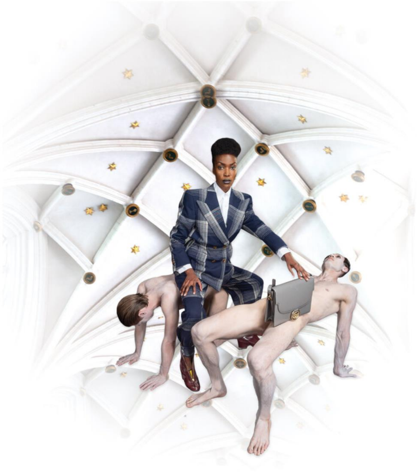
GUCCI suit, shirt, shoes, and bag and DALMATA earring.