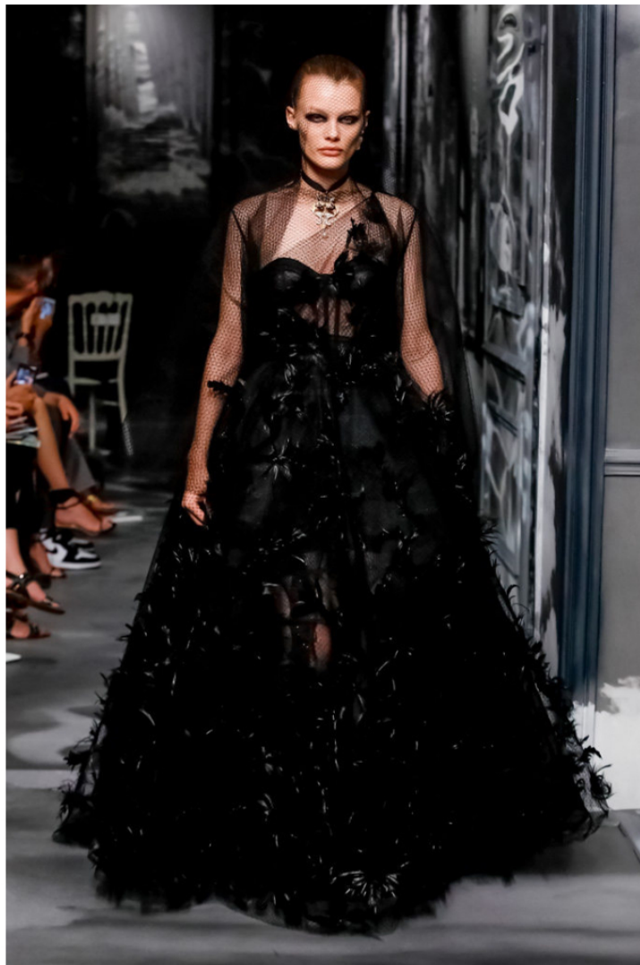
Christian Dior - Haute Couture - Fall/ Winter 2019- 2020 - Paris

The art of using artistic references to inspire groundbreaking fashion has rarely been better expressed than in the latest haute couture show of Christian Dior where the underlining theme was the complimentary professions and skills of architecture and fashion.