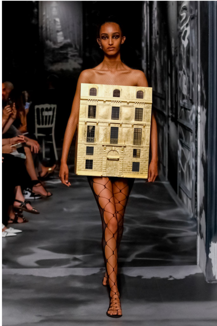
Christian Dior - Haute Couture - Fall/ Winter 2019- 2020 - Paris

“A dress is a work of architecture, conceived to render more sublime the proportions of a woman’s body,” Monsieur Dior was even quoted as saying in the program notes.