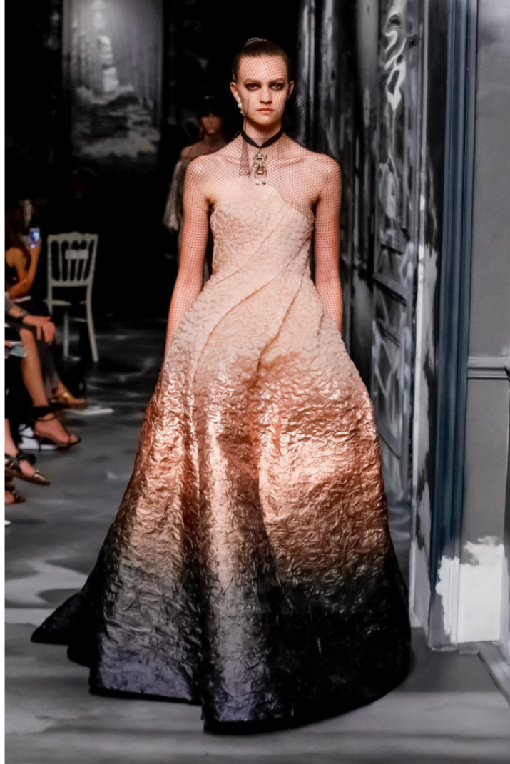
Christian Dior - Haute Couture - Fall/ Winter 2019- 2020 - Paris

She referenced the famed architectural critic Bernard Rudofsky, who saw clothes as creative constructions that imagined entirely new shapes for the human form.